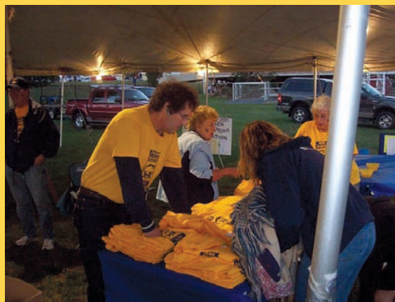
Above, Penn Manor Alumni volunteers help to hand out PMAA t-shirts to the first 150 alums who stopped by the tent. At left, a future alum received a Penn Manor face tattoo.

Mark your calendars - Homecoming 2011 will be held on Friday, October 7 against McCaskey.