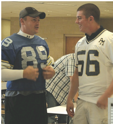
Top of page - The future of Penn Manor Football!

After the reception everyone attended the home football game with Exeter High School at Biemesderfer Stadium. At halftime all returning players were introduced to an enthusiastic crowd. In a fitting tribute to the returning alumni the 2009 Comets team dominated the visitors from Exeter 49-14.