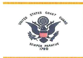
U.S. COAST GUARD

Talk with Congressman Dent, staff from Senator Toomey's office and representatives of the Air Force, Naval, Merchant Marine and Coast Guard Academies, the U.S. Military Academy at West Point and the R.O.T.C. to gain a better understanding of the nomination and admission process.