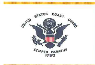
U.S. COAST GUARD

Talk with Congressman Dent, staff from Senator Toomey's office and representatives of the Air Force, Naval, Merchant Marine and Coast Guard Academies, the U.S. Military Academy at West Point and the R.O.T.C. to gain a better understanding of the nomination and admission process.