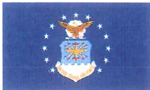
U.S. AIR FORCE

For more information please call Sue at (610) 434-1444 or Melanie at (610) 770-3490