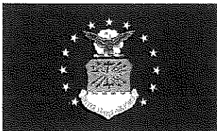
U.S. AIR FORCE

For more information please call Sue at (610) 434-1444 or Melanie at (610) 770-3490